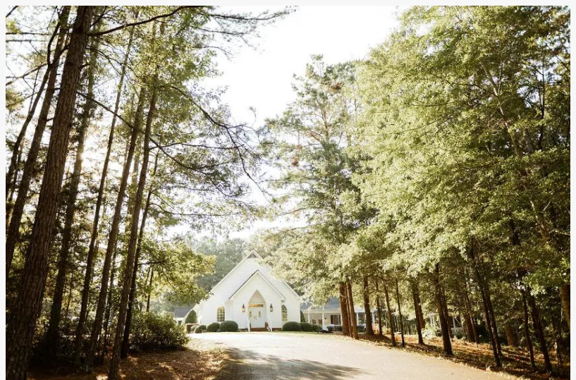
Front view of Evergreen Venue in Rainbow City, AL