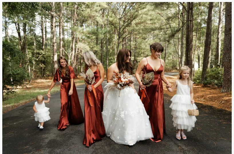
Wedding Bridal Party at Evergreen Venue in Rainbow City, AL