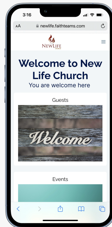
Faith Teams Community on your Mobile Phone