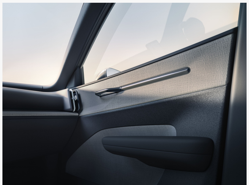
Bcomp's natural fibre composites are featured in Volvo's EX30 dashboard and door trim.

Tech Fund are already using powerRibs™ and ampliTex™. For example, ampliTex™ fabric is being applied at volume for visible interior components in the new electric Volvo EX30, while BMW is using both products in the design of performance interior and exterior parts for its BMW M4