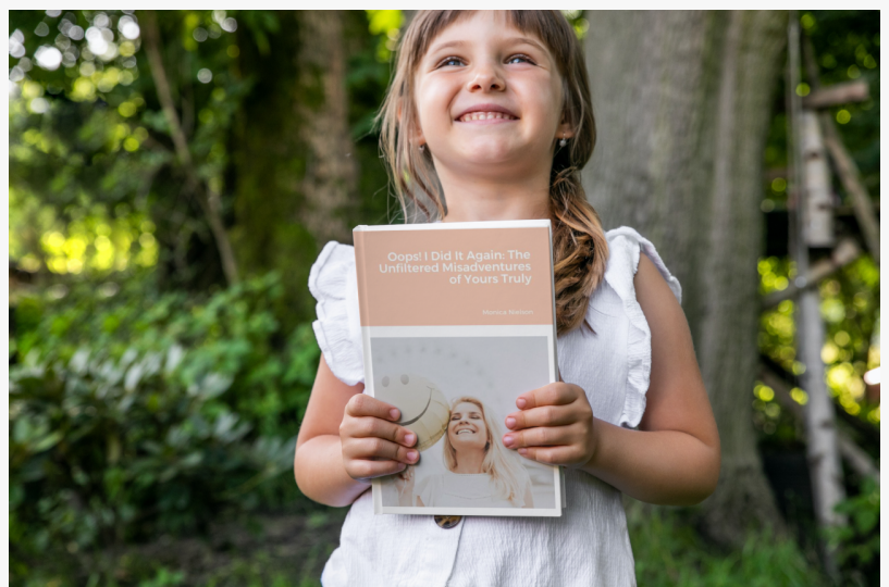
Kindred Tale's Beautiful Keepsake Book

Capture your most cherished memories and express deep appreciation for mom. Contribute your Mother's Day digital tribute before May 14th and download your free "Letters to Mom" PDF templates. Or give the gift of preserving their life's journey by taking $15 off an annual Kindred Tales memoir writing subscription. Visit https://kindredtales.net to learn more.