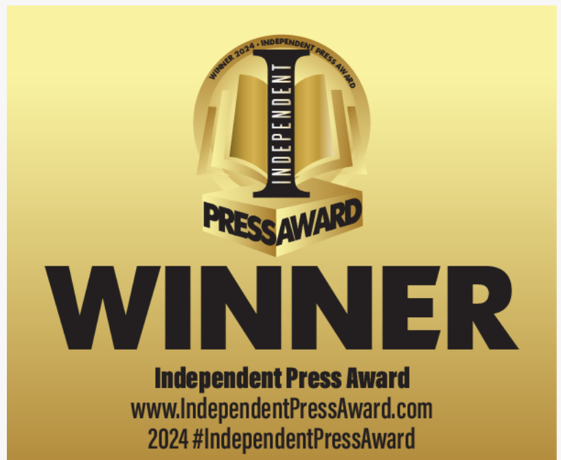
2024 IPA Winner logo