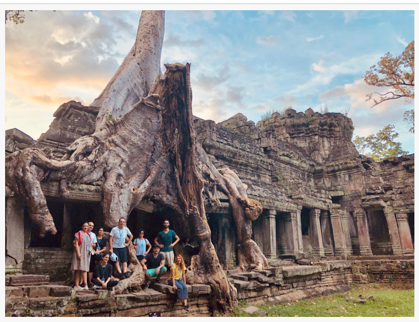
One of the many temples we explore

LAS VEGAS, NEVADA, USA, April 16, 2024 /EINPresswire.com/ -- Lesley Logan Pilates is thrilled to announce the launch of Crows Nest Retreats, a unique and exclusive program that offers a transformative experience at a private compound in the breathtaking landscapes of <u>Cambodia</u>. This allinclusive retreat house provides the perfect setting for individuals and groups looking to host their events or