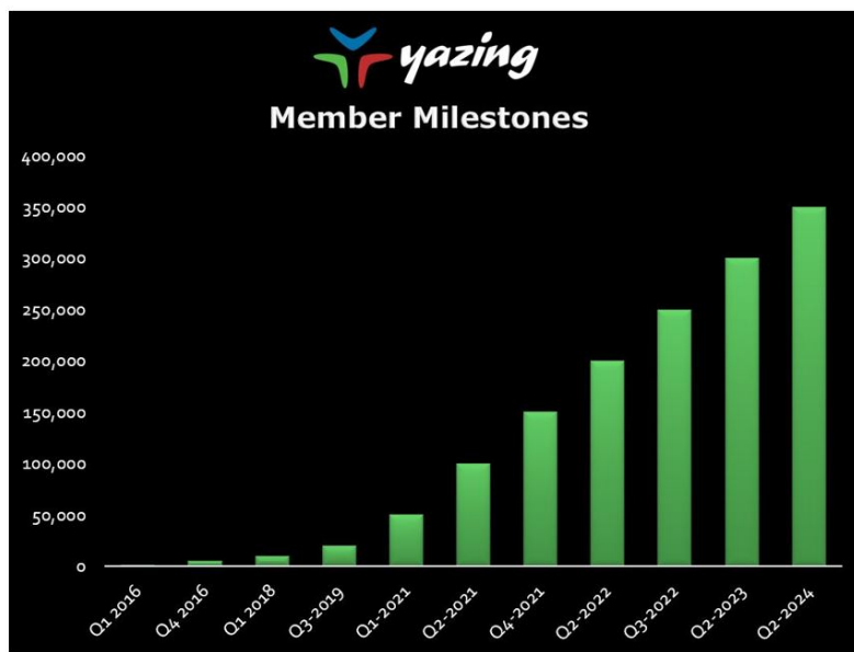
Yazing Membership Milestones