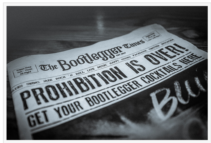
The Bootlegger Cocktail Menu

RICHMOND, LONDON, UNITED KINGDOM, April 16, 2024 /EINPresswire.com/ -- Get ready to raise a glass and Charleston the night away! Bootlegger, a renowned chain of speakeasy-inspired cocktail bars, is thrilled to announce the arrival of its sixth location in the heart of Richmond, London. Tipped to open its doors in