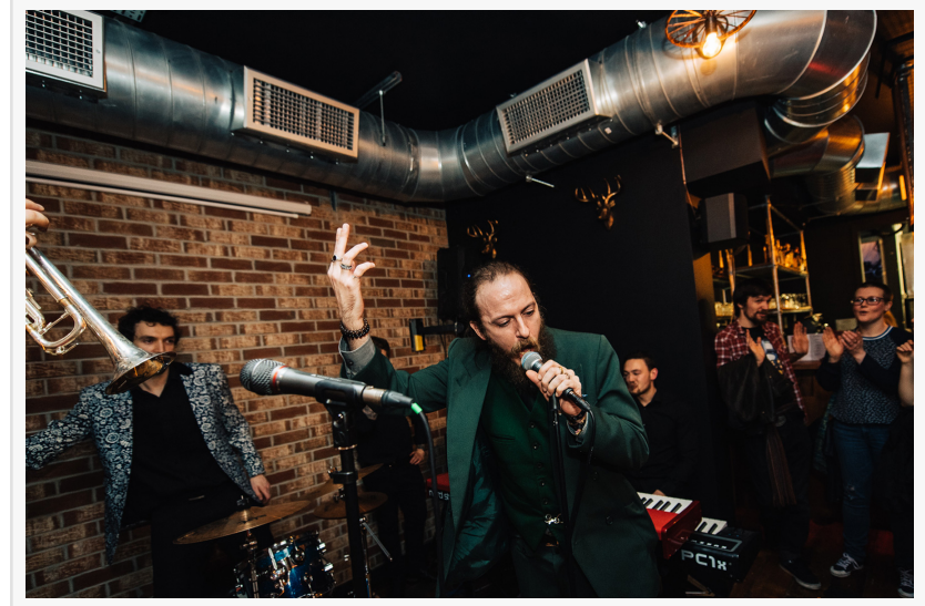
Bootlegger Jazz Artist

in Richmond will boast a lively entertainment scene, featuring both local and international musicians. Expect everything from smooth jazz and sultry blues to upbeat swing and energetic DJ sets.