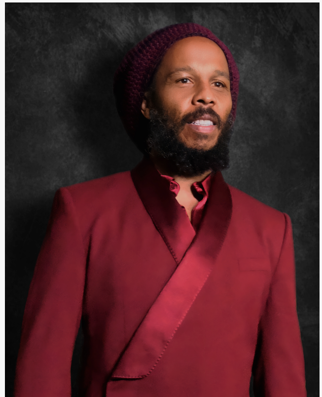
Headshot of Ziggy Marley