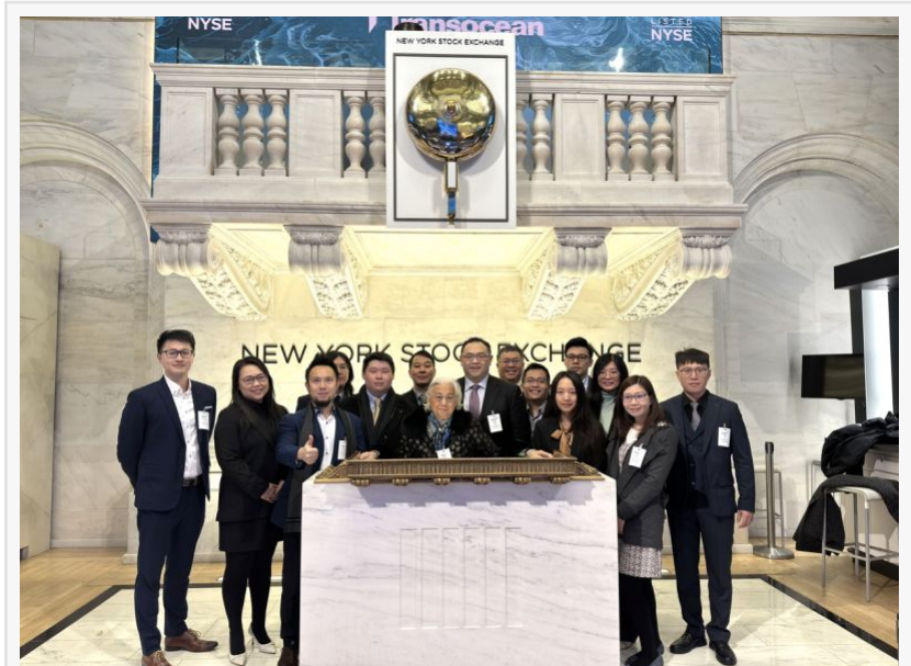
Northann Corp. New York Stock Exchange: NCL

Combining the natural beauty of wood with the durability and sustainability of modern materials, NCL SuperOak Hybrid Wood Planks represent a breakthrough in flooring technology. The product will be in stock across the U.S. starting in May, ensuring customers have access to