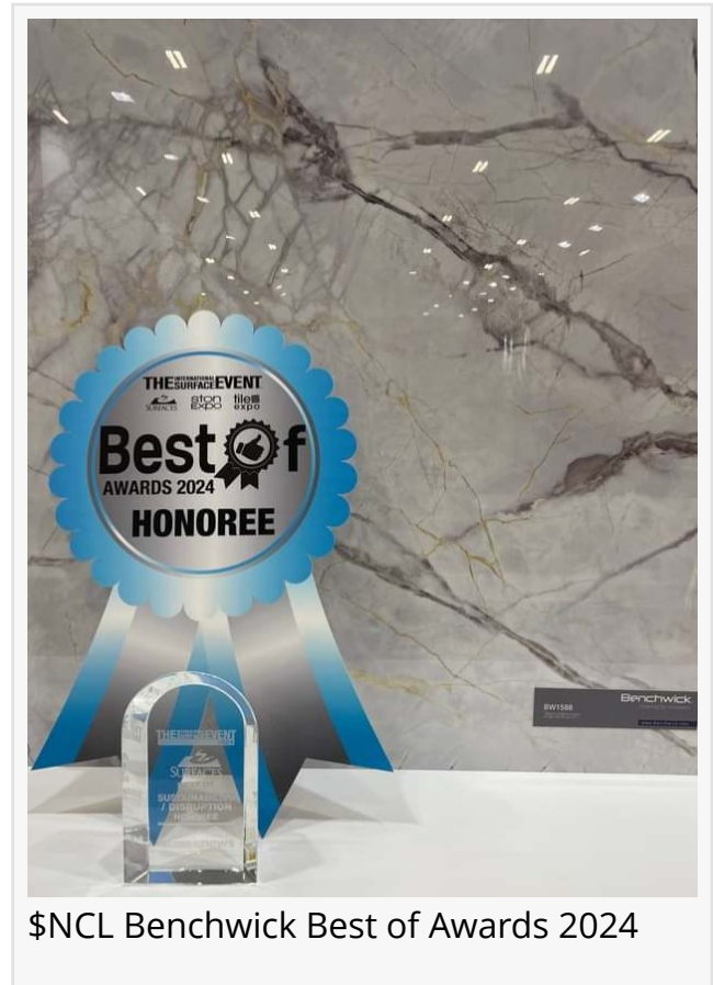
$NCL Benchwick Best of Awards 2024

This agreement solidifies a collaborative effort with NCL to enhance both parties' respective offerings in the digital printing space. The NCL commitment to innovation and quality aligns perfectly with I4F's expertise in digital printing technology, creating a synergy that promises exciting advancements in the flooring industry.