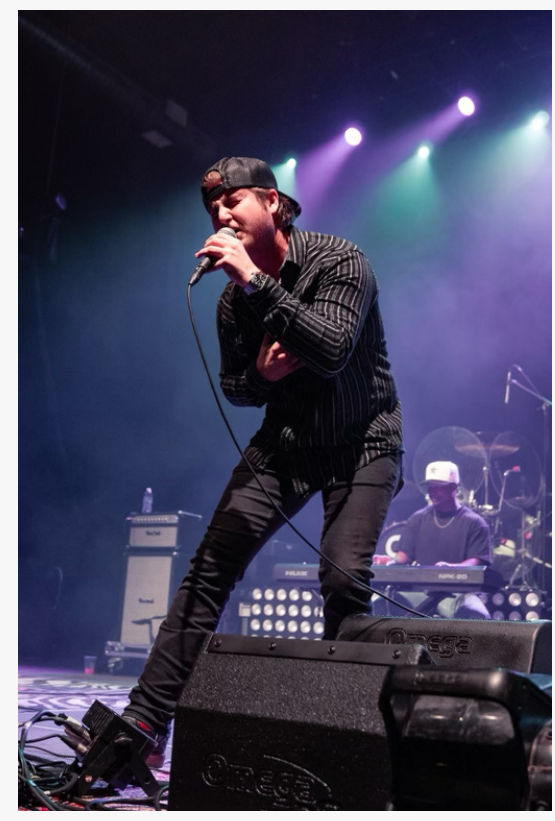
Cam Allen, photo credit Tyler Williams.

"Kick Me Out" isn't just heard; it's felt. It details the struggle of trying to find the strength to stand up and walk away when every fiber of your being won't allow it. Set against the backdrop of a dimly lit bar, the song captures moments of nostalgia and regret when