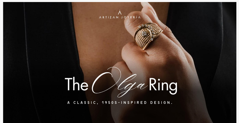
The Olga Ring, a classic, 1950s inspired design.