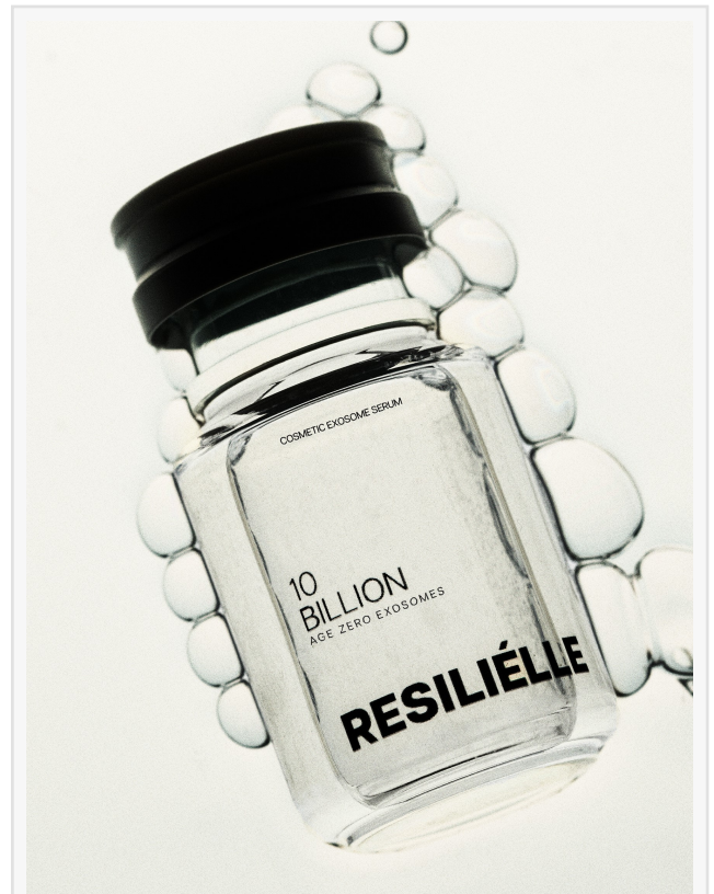
Resilielle Age Zero Exosomes