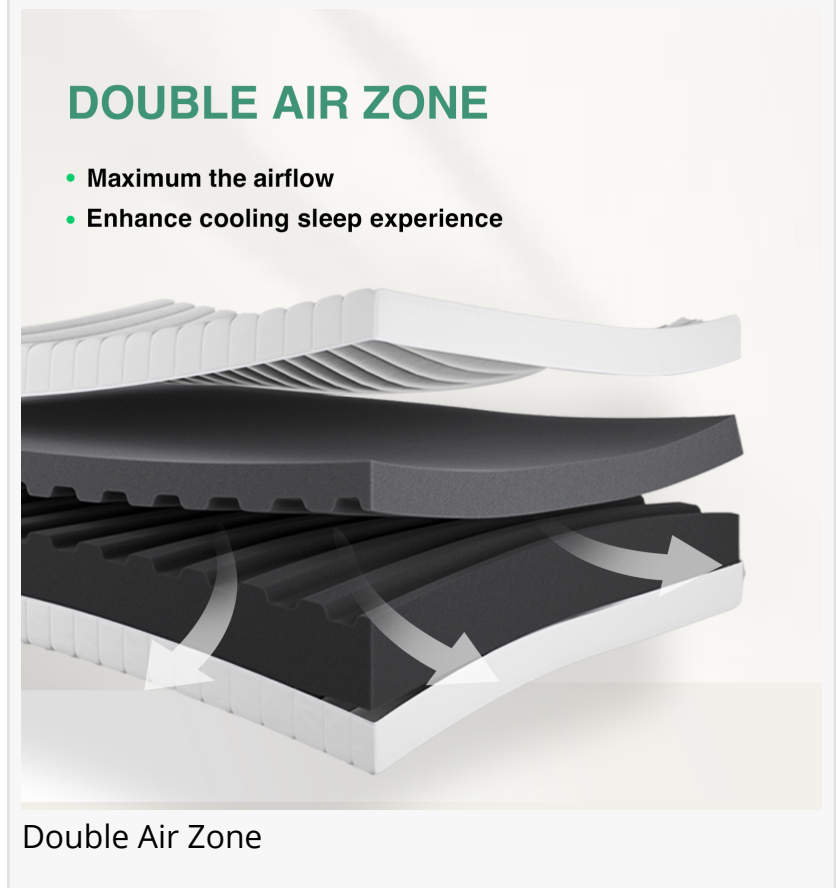
Double Air Zone