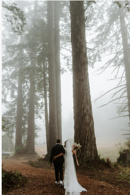
Couple Walking Through the Redwoods at Ridgefield