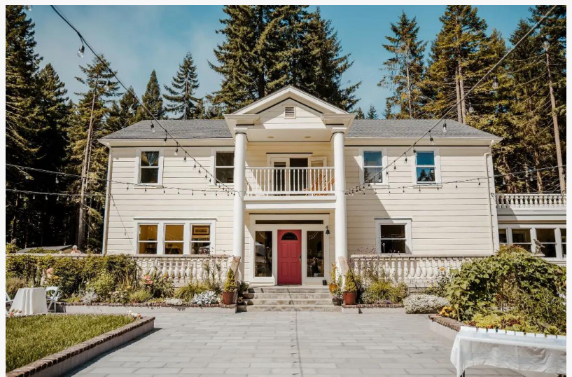
The Main House at Ridgefield in Arcata CA