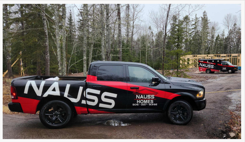
Nauss Homes wins ThreeBestRated® award

Nauss Homes are renowned for their ability to seamlessly blend luxury with energy efficiency. Since its establishment in 2007, they have evolved from focusing on small interior and exterior renovations to delivering larger renovations and home additions, and they now specialize in new energyefficient custom luxury homes. For