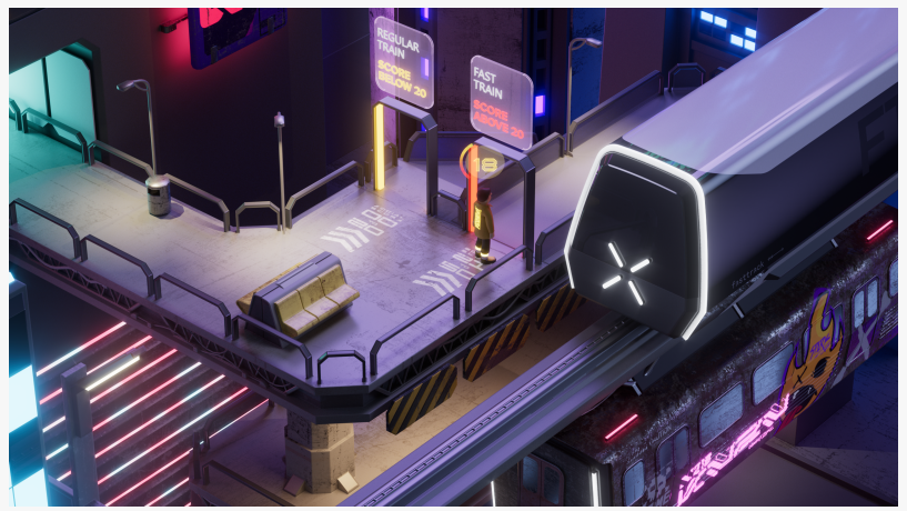
10Forward scenario - Neotropia - High tech, low prosperity

"While we are here to help clients devise informed strategies that are bold and forward-thinking, the ultimate endgame is to ensure technology is used as a force for good. As a business