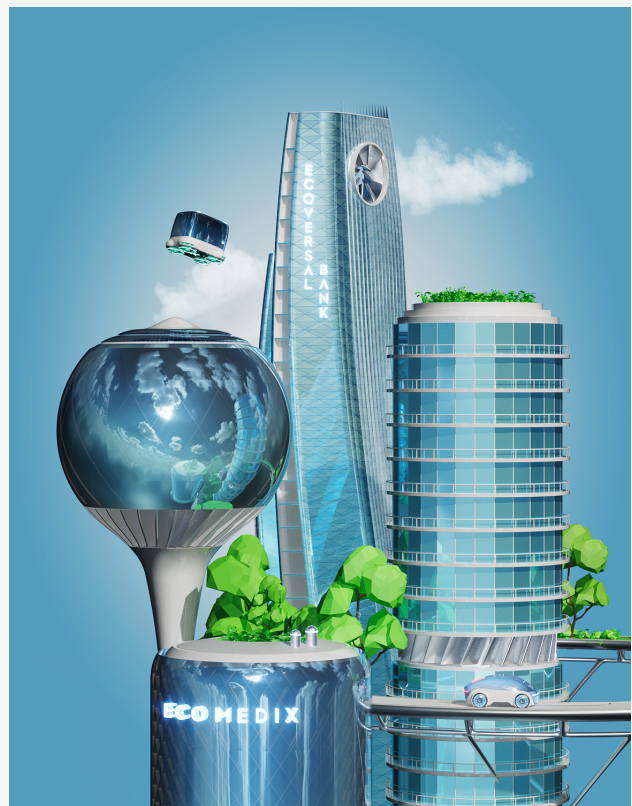
10Forward scenario - Bloomfield - High tech, high prosperity