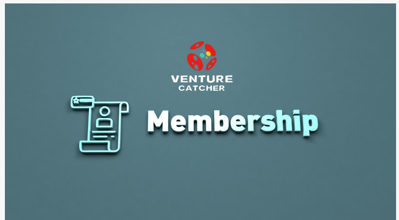
Venture Catcher Membership