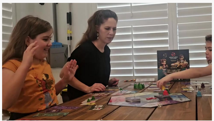
Paycheck to Billionaire Player