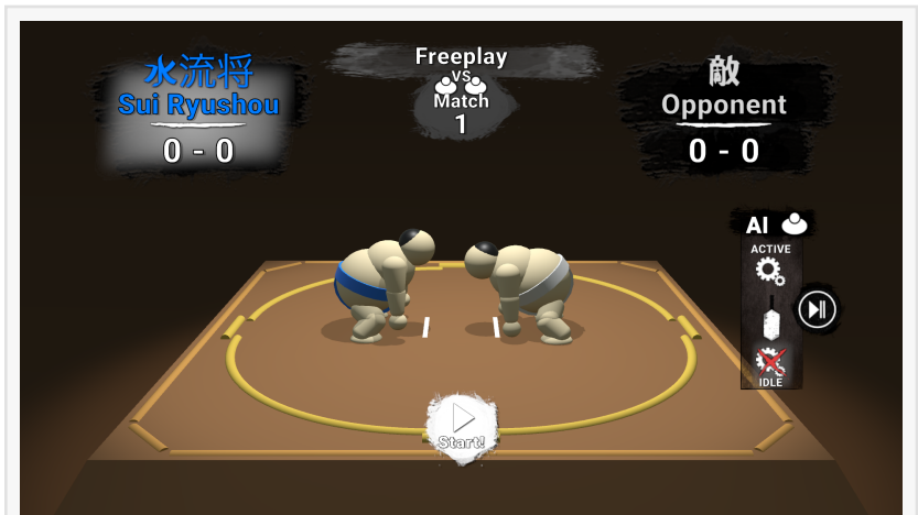
Sumo Wrestling Challenge tachiai (start of match)

Universal App - supports iPhone, iPod Touch, and iPad, including standard, Retina, and iPhone X displays. Even runs on Apple Mac or MacBooks equipped with a new Apple's M-series Silicon chip with easy to use mouse controls.