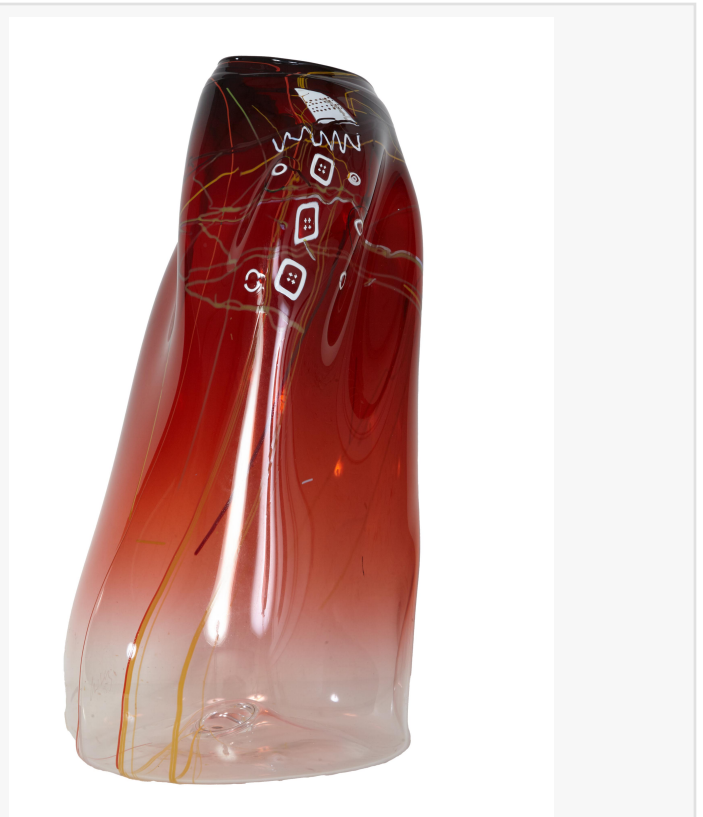
This garnet flame blown glass basket executed in 2018 by the renowned glass blower Dale Chihuly (American, b. 1941) is expected to fetch $5,000-$10,000.

Lots 652 thru 655 comprise a nice selection of Newcomb vases, while lots 532, 536, 537, 538 and 539 showcase a fine collection of clocks, including swing arm clocks after Auguste Moreau and Julien Causse. There is an impressive selection of patinated bronze figures and jardinieres, including lot 685, a pair of large 20th c. patinated and gilt bronze jardinieres (est. $2,500-$4,500).