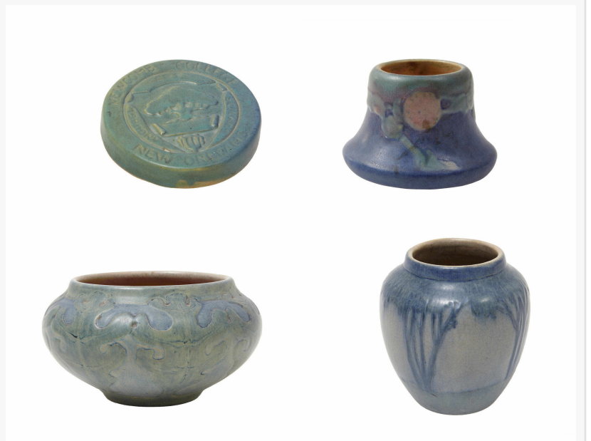
Lots 652 thru 655 comprise a nice selection of Newcomb vases.