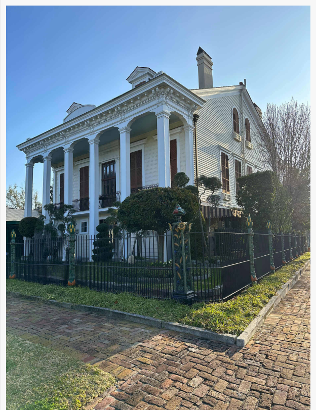
The auction will feature items from the Dufour-Plassan House, a New Orleans landmark building known for its beautiful cornstalk fence.

Adam Lambert Crescent City Auction Gallery