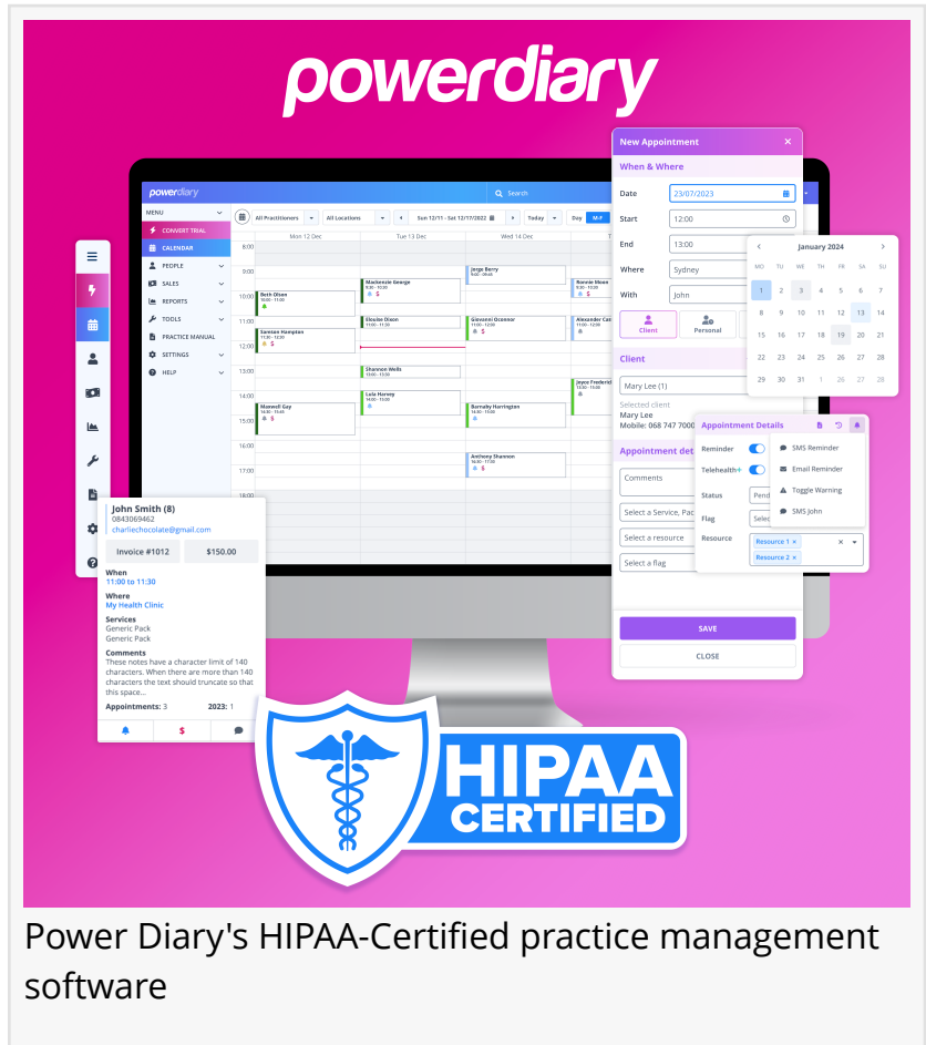
Power Diary's HIPAA-Certified practice management software