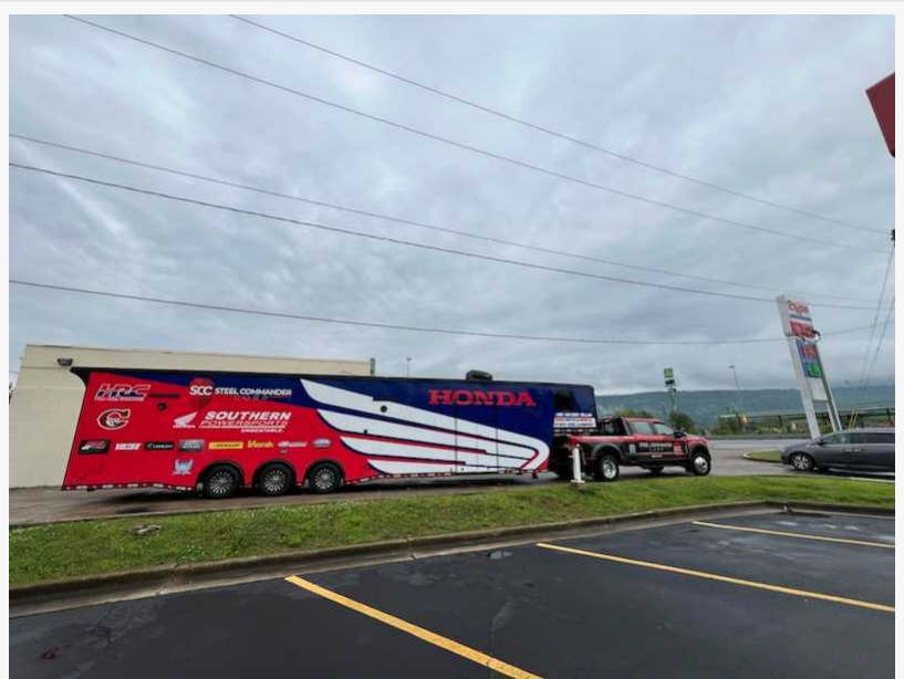
Steel Commander Corp and the Real Steel Racing team on its way to Road Atlanta, Georgia race.

For more information about Steel Commander Corp, please visit www.steelcommandercorp.com . Find them on Facebook, Twitter and on LinkedIn.