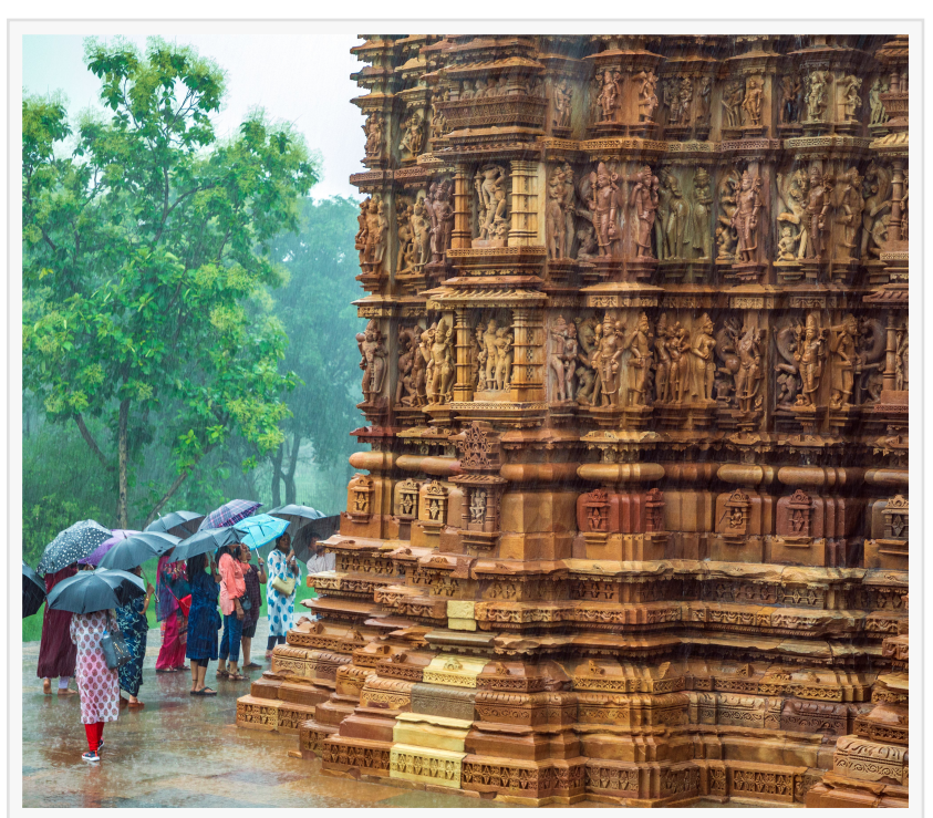
Women Guided Tours at Khajuraho Temples