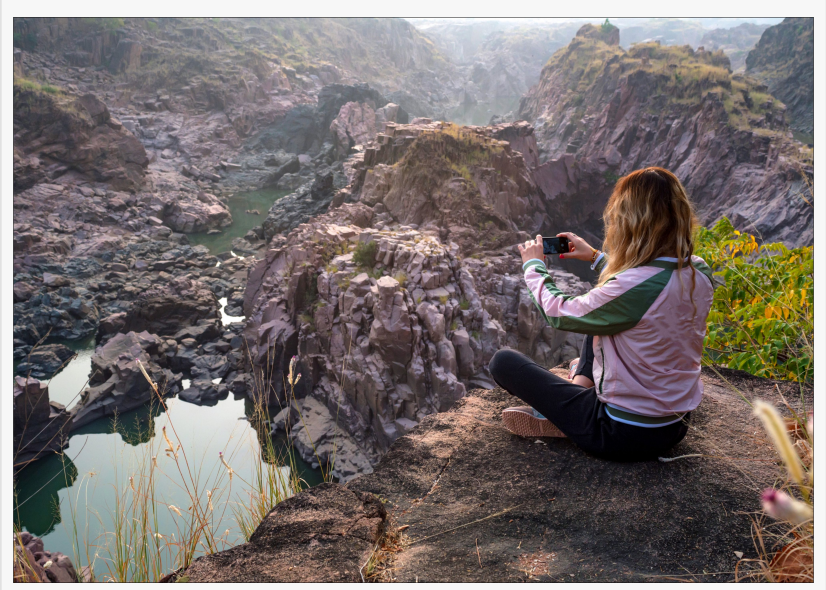
Gharial Sanctuary in Madhya Pradesh

This press release can be viewed online at: https://www.einpresswire.com/article/704614713