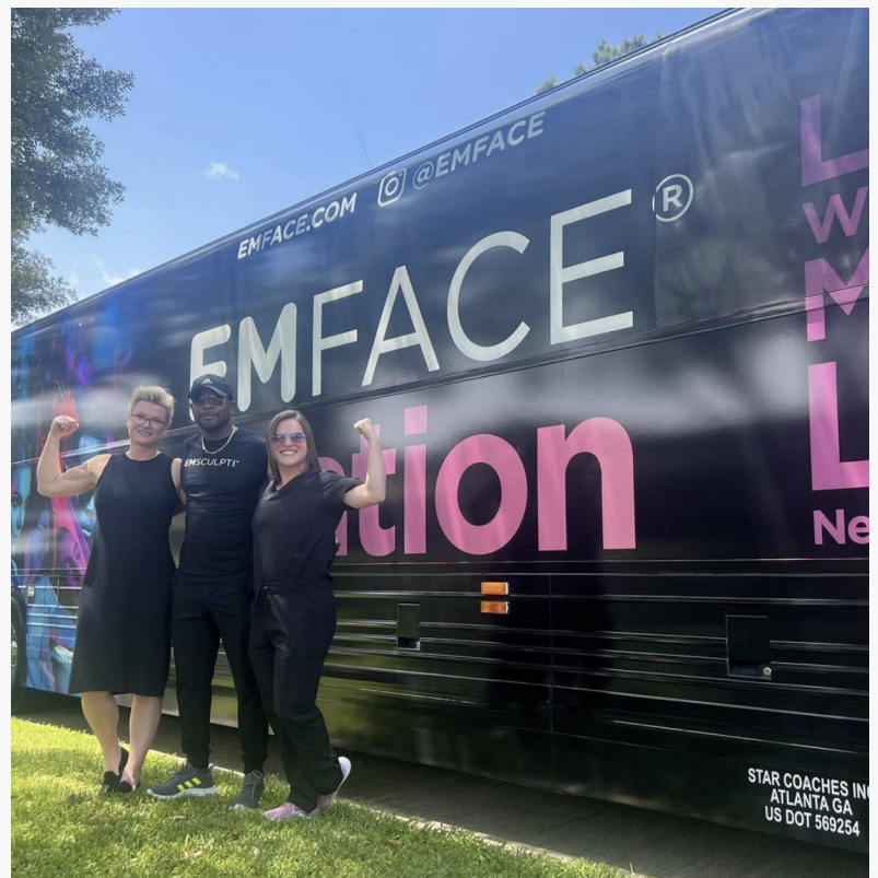
Team at EMFACE Event