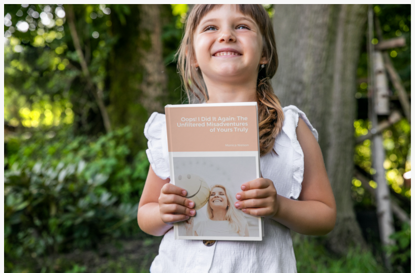
Kindred Tale's Beautiful Keepsake Book

/EINPresswire.com/ -- Kindred Tales , a groundbreaking memoir writing platform, today announced its official launch on the popular Product Hunt community. Designed to make capturing life stories easy and enjoyable, Kindred Tales empowers anyone, especially parents and grandparents, to document their unique experiences for future generations.