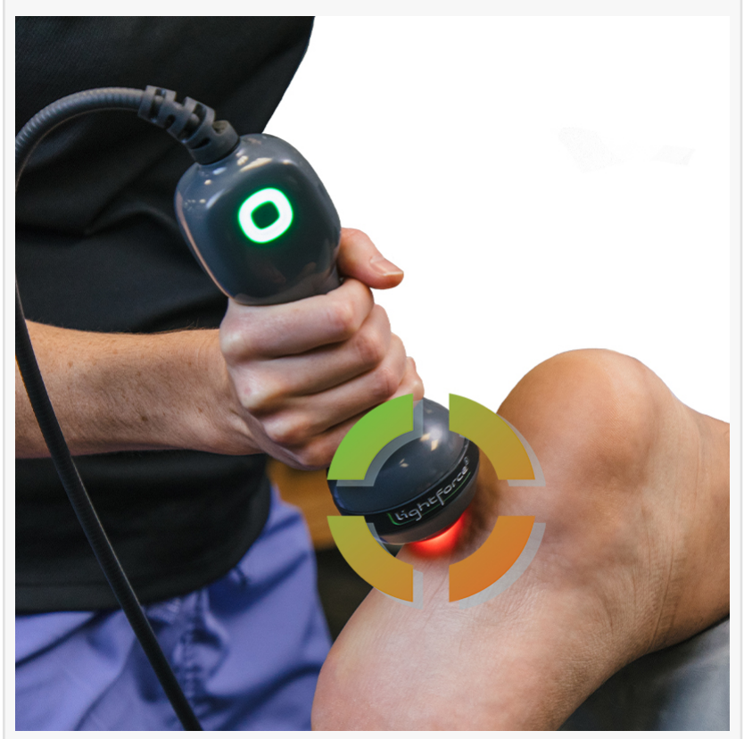
Patient receiving laser treatment in their feet

About Hands-On Physical Therapy and Hands-On EMG Testing: