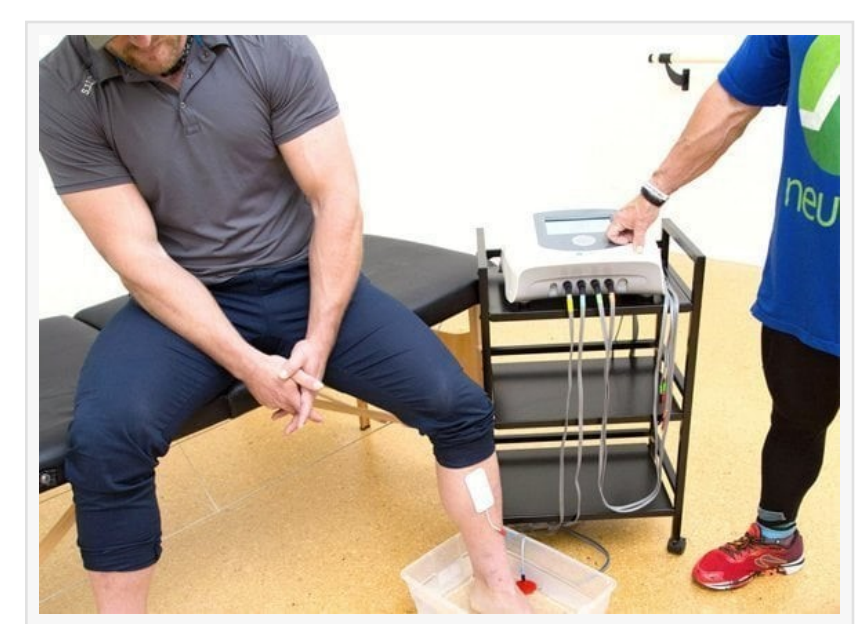
Neubie treatment for neuropathy patient