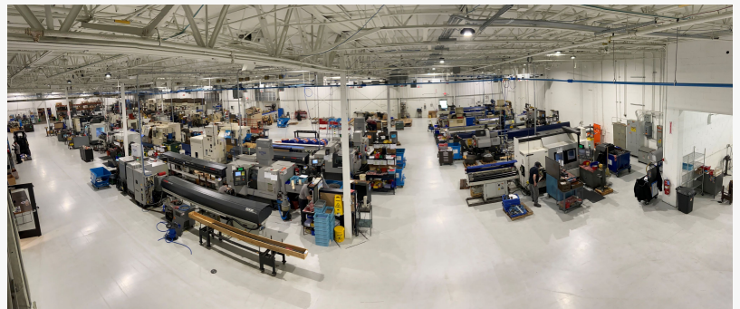
Pindel Global Precision's World-class Contract Manufacturing