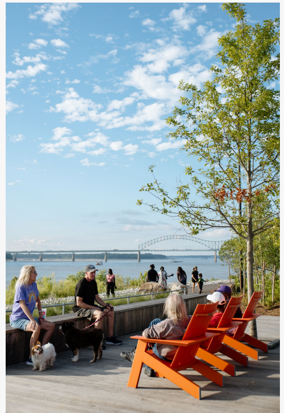
Tom Lee Park has fast become a top destination on the Memphis riverfront