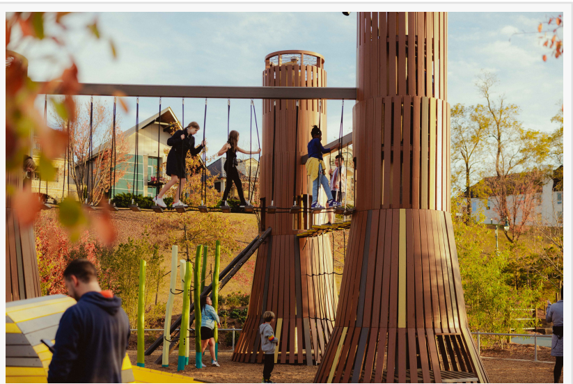
The Life on the River playground features a playscape inspired by the Mississippi River

Tom Lee Park features a hammock grove that overlook the Mississippi River, the 15,000-square-foot Sunset Canopy with courts for pickleball and pick-up basketball (with equipment available to borrow free of charge), extensive educational and fitness programming, a Ben and Jerry's ice cream stand and the 23,000-square-foot Life on the River