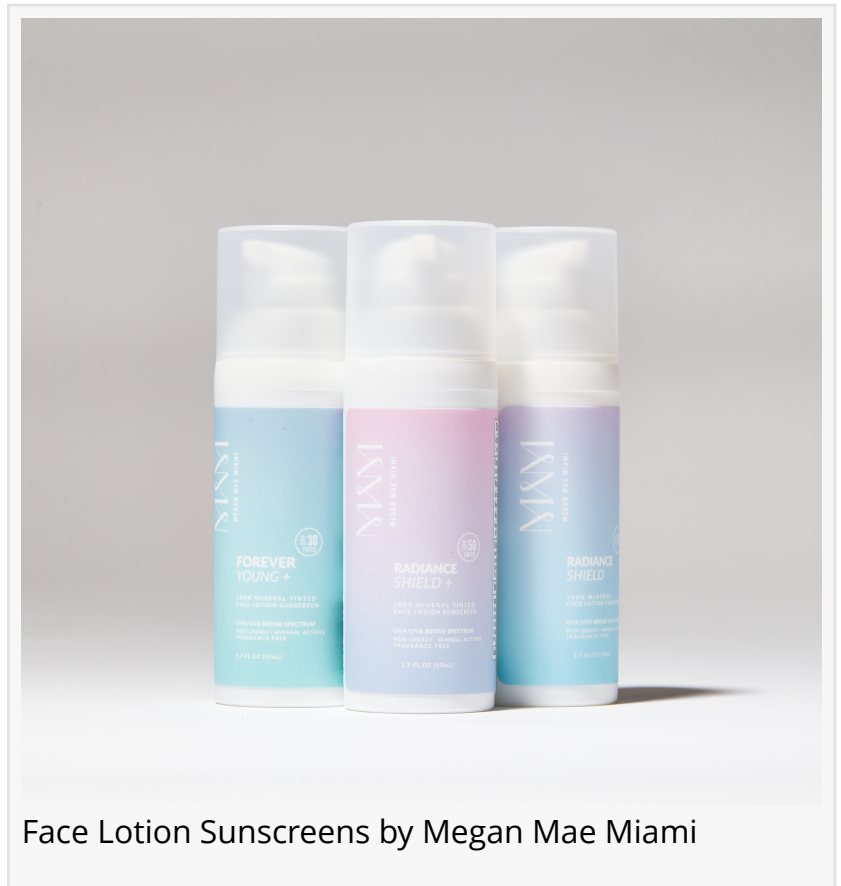
Face Lotion Sunscreens by Megan Mae Miami

MIAMI, FLORIDA, USA, April 22, 2024 /EINPresswire.com/ -- Megan Mae Miami, the lifestyle brand known for its luxury, made-in-the-US, sustainable swimwear collection, announces the official release of its first group of suncare essentials: three new 100% mineral-based face lotion sunscreens. Setting itself apart with distinctive features and benefits, each face lotion sunscreen boasts a high concentration of zinc oxide, ensuring superior protection against harmful UV rays. This milestone release signifies Megan Mae Miami's first venture into the realm of suncare, showcasing the brand's unwavering dedication to quality and innovation, while prioritizing environmental responsibility.