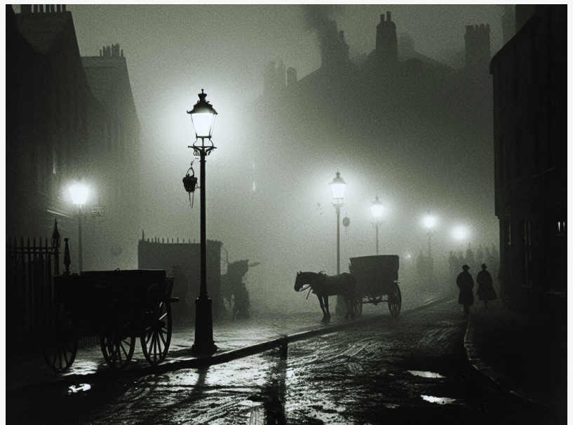
The Whitechapel of Jack the Ripper 1888