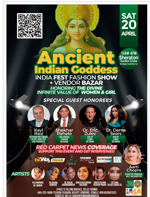
Ancient Indian Goddess India Fest Fashion Show & Vendor Bazaar - Celebrity and Artist Attendees

The highlight of the Ancient Indian Goddess Fest is a spectacular fashion show, curated to