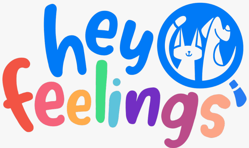
Hey Feelings Logo