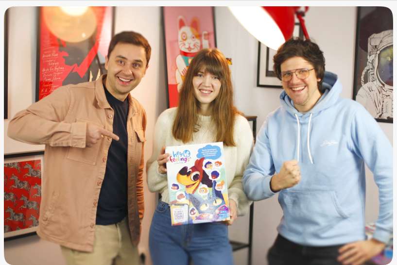
Hey Feelings Founders