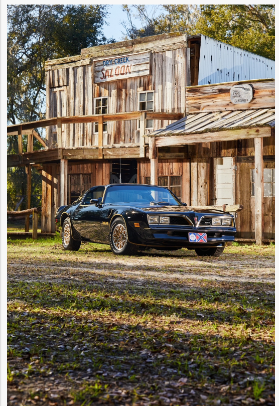
Burt's Trans Am Rides one Last Time

Burt Reynolds' association with the Pontiac Trans Am also extended beyond the silver screen. Reynolds championed the movie's success by leveraging his star power to endorse special edition Trans Ams that closely resembled the iconic car from the film. With Reynolds'