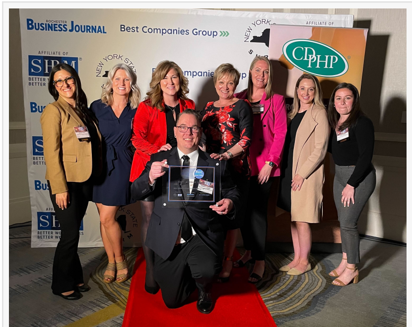
Center for Internet Security Team Accepting 2024 Best Companies in NY Award