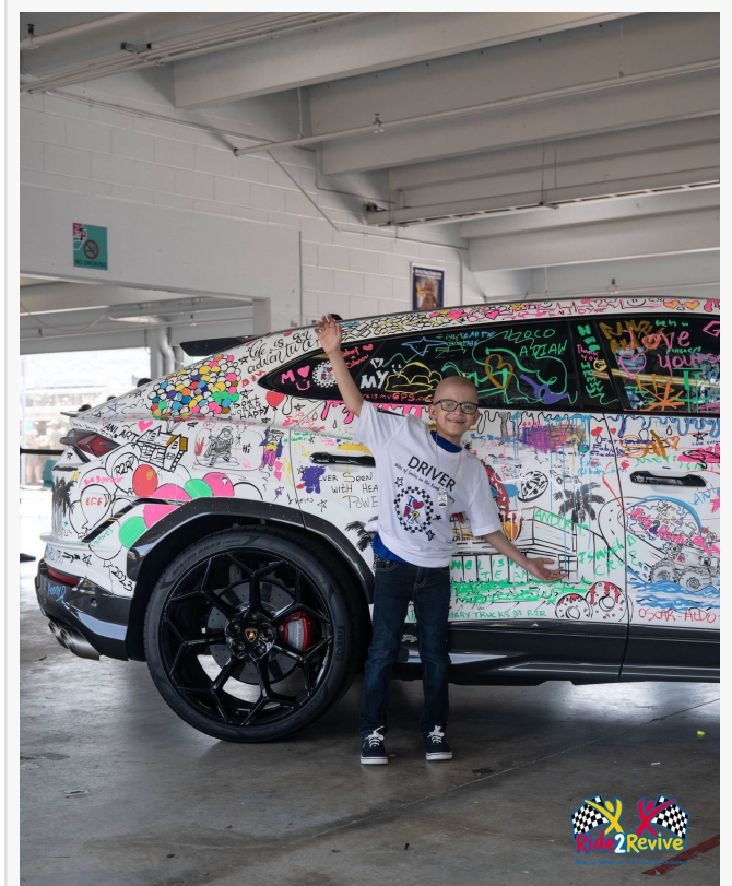
Children enjoy a day filled with fun activities at Ride2Revive including drawing on a Lamborghini Urus.

Visit www.ride2revive.org to learn more.