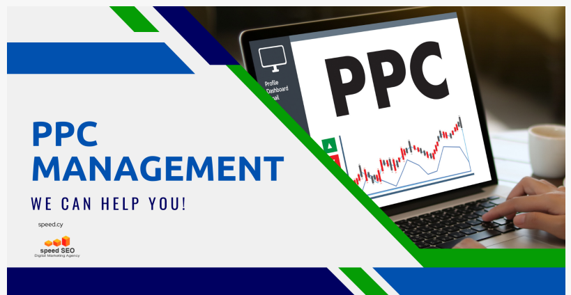
PPC Management Services Offered by M&G Speed Marketing LTD.