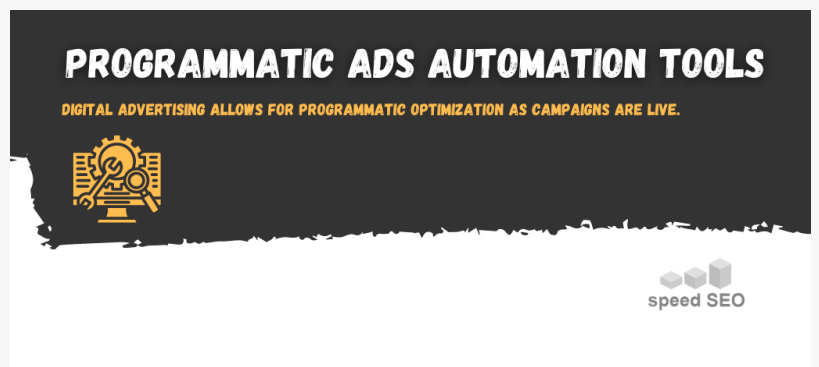
PPC Management Services Offered by M&G Speed Marketing LTD.