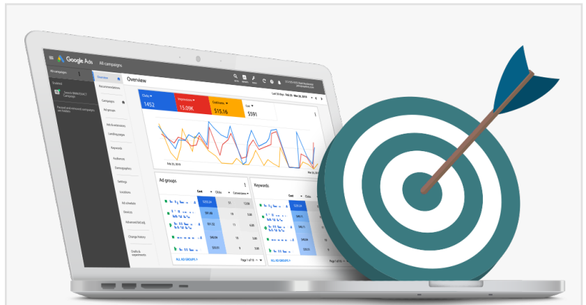
PPC Management Services Offered by M&G Speed Marketing LTD.

As a trusted partner, M&G Speed Marketing LTD. is committed to delivering exceptional customer service and measurable results. With their PPC management services, businesses in Cyprus can expect increased visibility, enhanced brand recognition, and a significant boost in