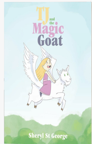
TJ and the Magic Goat

https://events.latimes.com/festivalofbooks/schedule/ , serves as a valuable resource, enabling visitors to plan their itineraries strategically and ensure they don't miss out on the sessions that resonate with their interests and passions.