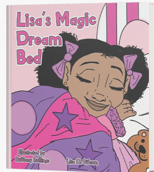
Lisa's Magic Dream Bed