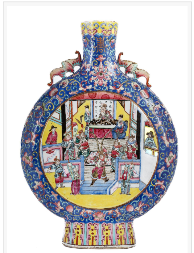
Important 19th century Chinese porcelain moon flask, 19 ½ inches tall, each side painted with large reserves of figures and bat form handles applied to the base of the neck (est. $5,000-$10,000).