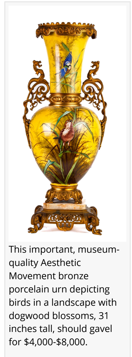
This important, museum-quality Aesthetic Movement bronze porcelain urn depicting birds in a landscape with dogwood blossoms, 31 inches tall, should gavel for $4,000-$8,000.

John McInnis John McInnis Auctioneers +1 978-388-0400 email us here