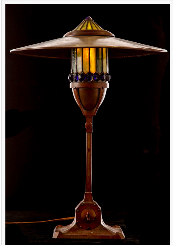
Early Tiffany table lamp signed "GDT Co." with a center post sleeved to allow the glass shade to drop, exposing the socket and bulb, 20 inches tall (est. $18,000-$24,000).

A bronze sculpture by the 19th century French sculptor Duchoiselle titled Fishing Allegory / Native American Woman , 24 inches tall, signed and dated 1864, has an estimate of $10,000-$15,000; while a marble sculpture by the Italian sculptor Fortunato Galli (1850-1918), titled The Broken Plate , 36 inches tall, signed "F. Galli Firenze", dated 1885, should bring $5,000-$10,000.