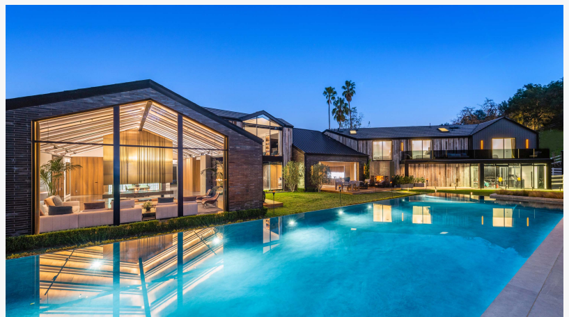
Striking modern farmhouse designed by Nobel LA