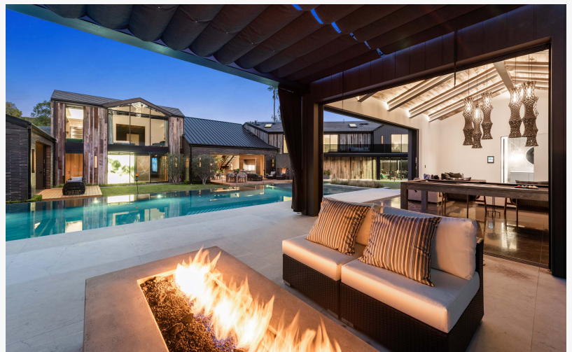
65' swimming pool with a spa