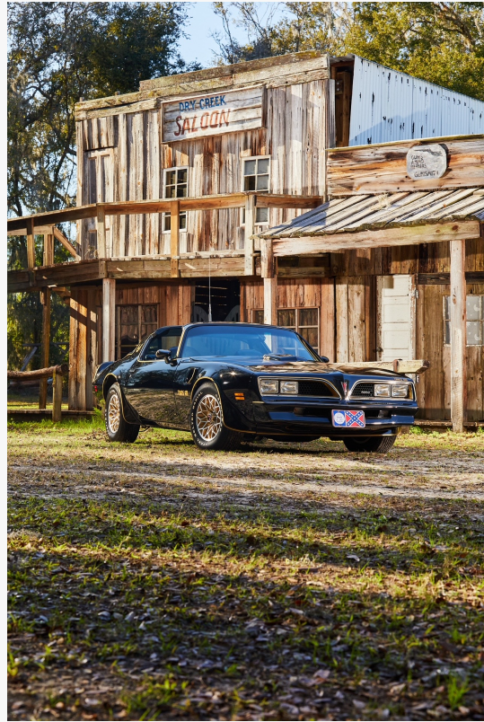
Burts 1977 Trans Am SE Bandit on Set

From popularizing CB radio jargon to immortalizing the iconic black Pontiac Trans Am, the film's influence has undoubtedly reverberated far beyond the confines of the silver screen. As the 2024 Palm Beach Auction presents the opportunity to bid on Bandit's "Bandit," the legacy of "Smokey and the Bandit" lives on. With each rev of the engine and with every bid, the spirit of rebellion and freedom embodied by the film continues to captivate audiences, ensuring its place in cinematic history and pop culture for generations to come. Join us April 18-20 and register to bid