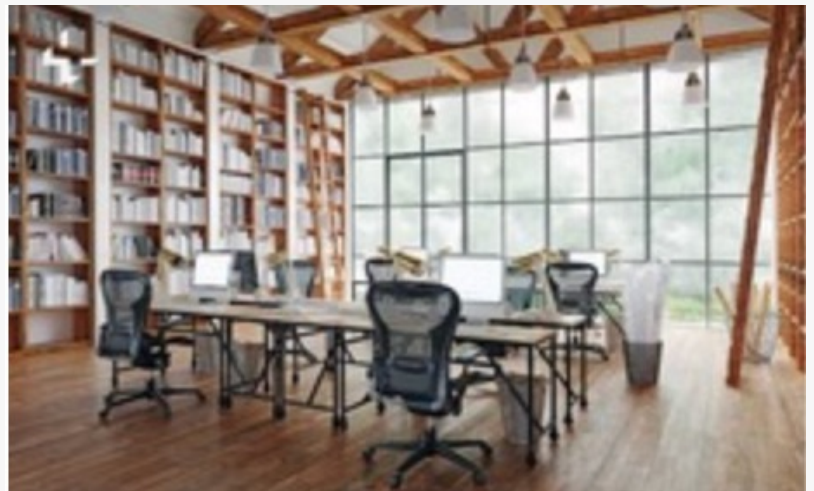
About MAHA Magazine

This press release can be viewed online at: https://www.einpresswire.com/article/705253086 EIN Presswire's priority is source transparency. We do not allow opaque clients, and our editors try to be careful about weeding out false and misleading content. As a user, if you see something we have missed, please do bring it to our attention. Your help is welcome. EIN Presswire, Everyone's Internet News Presswire™, tries to define some of the boundaries that are reasonable in today's world. Please see our Editorial Guidelines for more information. © 1995-2024 Newsmatics Inc. All Right Reserved.