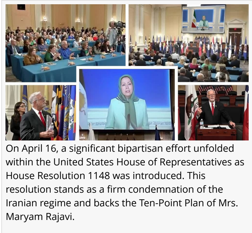
On April 16, a significant bipartisan effort unfolded within the United States House of Representatives as House Resolution 1148 was introduced. This resolution stands as a firm condemnation of the Iranian regime and backs the Ten-Point Plan of Mrs. Maryam Rajavi.

House Resolution 1148 emphasizes the imperative for Western nations to hold the Iranian regime accountable for its actions, which incite violence, terror, and instability. It condemns Iran's extensive support for proxies in Lebanon, Syria, Iraq, Yemen, Gaza, and beyond, as well as its escalating aggression against American forces and global shipping lanes.