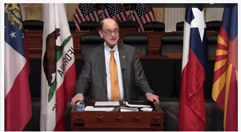
Brad Sherman emphasized establishing a secular, democratic, non-nuclear republic of Iran. Reminding the audience about the impressive 243 co-sponsors for the H.Res 100. He said the strong bipartisan support of the Iranian Resistance has received in the 118th Congress.

The Democratic Congressman criticized the regime's support for terrorist organizations, highlighting their role in destabilizing the region. He also reminded the regime's grave human rights abuses, citing specific instances of executions and tragic deaths like that of Mahsa (Jina) Amini, whose story resonated globally.