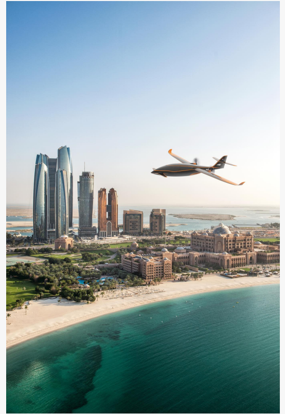
Decarbonised air taxi services in Western Australia are setting the stage for emerging electric aircraft