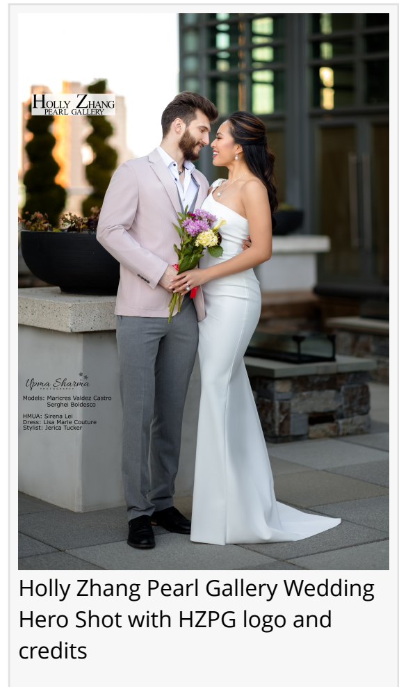
Holly Zhang Pearl Gallery Wedding Hero Shot with HZPG logo and credits