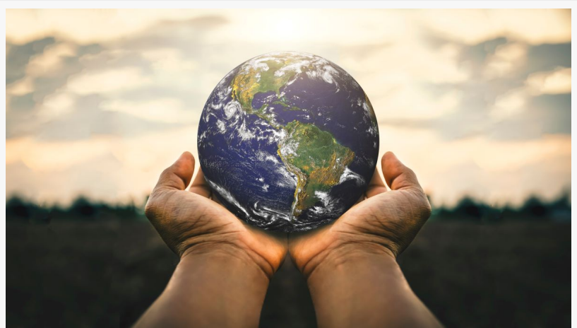
Verity One Earth Day

Earth Day marks a time for reflection on the environmental impact and the collective responsibility to manage spaces effectively, from local homes to the global stage. The day serves as a reminder of the importance of individual and community actions in preserving the environment.