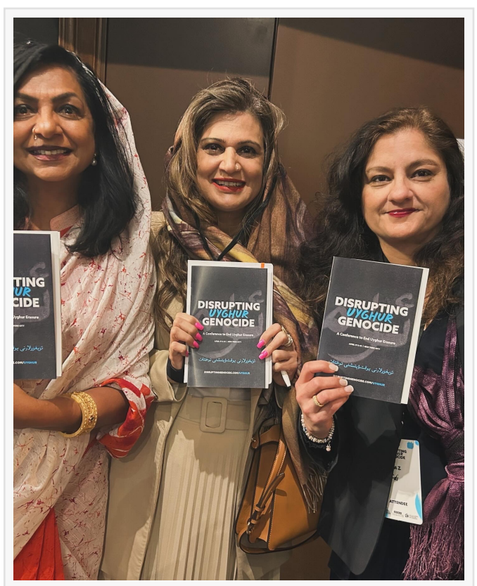
Muslim Women Speak

For more information about AMWEC and their efforts to address the Uyghur genocide, please visit their website at <u>www.ammwec.org</u> <u>www.muslimwomenspeakers.com</u>