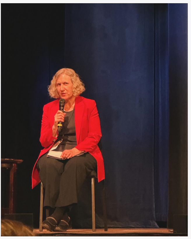
Ambassador Ellen Germain, Special Envoy for Holocaust Issue -Department of State

Staff Writer Ammwec +1 202-600-5186 email us here