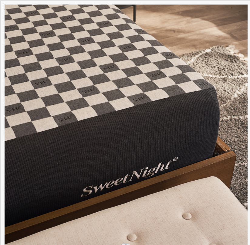
10-Year Warranty Service

Studies have shown that it takes at least 30 days for the human body to fully adapt to a new mattress. With 100 days, the customers can experience the mattress's performance across different seasons and body conditions. They