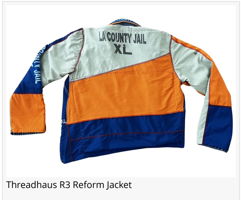
Threadhaus R3 Reform Jacket

NEW YORK, NY, UNITED STATES, April 26, 2024 /EINPresswire.com/ -- ThreadHaus, in collaboration with Homeboy Industries, is proud to announce the launch of its latest endeavor, the R3 Reform Jacket, marking a significant milestone in the intersection of fashion , sustainability, and social impact. In addition to Homeboy Industries, ThreadHaus is honored to partner with the California Product Stewardship Council and the Los Angeles City Sanitation Department in this transformative initiative.