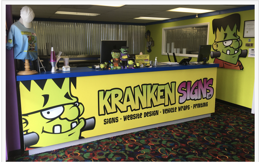
Welcome to the Charlotte Sign Company