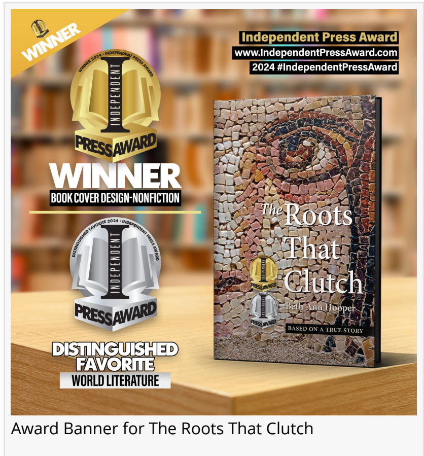
Award Banner for The Roots That Clutch